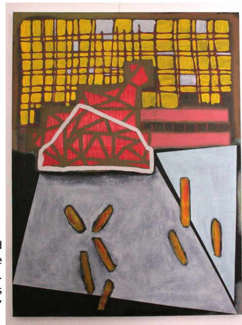
The girl sitting, signaled and took advantage of the confusion. Oil on canvas 40" x 30"